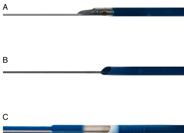
Figure 1 (A) First version of Guideliner with a metal proximal collar. (B) Second Version of Guideliner with a polymer proximal collar. (C) Third version of Guideliner with a polymer collar and proximal half-pipe lead in.

A total of 188 cases were identified where the V2 Guideliner was used. Technical success during the procedure was defined as PCI with successful stent deployment and <20% residual stenosis. Procedural success was defined as technical success and where no major or