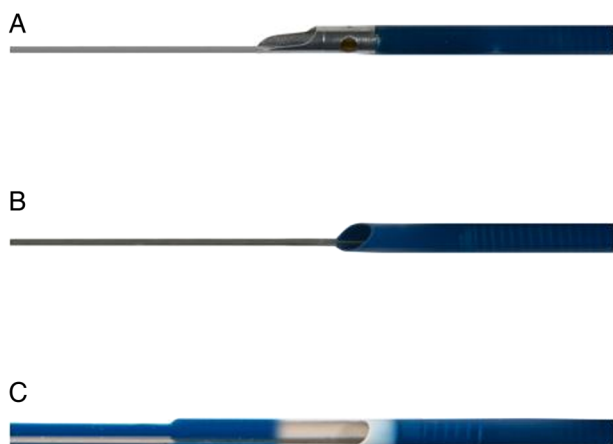
Figure 1 (A) First version of Guideliner with a metal proximal collar. (B) Second Version of Guideliner with a polymer proximal collar. (C) Third version of Guideliner with a polymer collar and proximal half-pipe lead in.

A total of 188 cases were identified where the V2 Guideliner was used. Technical success during the procedure was defined as PCI with successful stent deployment and <20% residual stenosis. Procedural success was defined as technical success and where no major or