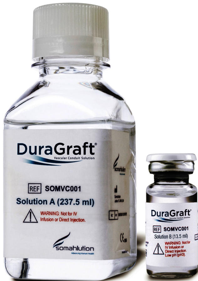
Figure 1 DuraGraft treatment solution.

will be conducted on all patients who withdraw or who are discontinued from the study.