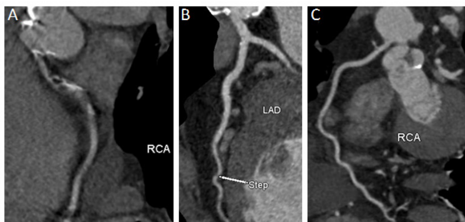
Figure 2 Representative CT-coronary angiogram curved multiplanar reformats illustrating grading system used to evaluate diagnostic image quality. (A) Significant artefact=1; (B) artefact not limiting diagnosis=2; (C) no artefact=3. LAD, left anterior descending; RCA, right coronary artery.