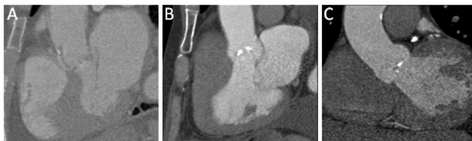
Figure 1 Examples of CT-aortograms illustrating the grading system used to evaluate diagnostic image quality. (A) Significant artefact=1; (B) artefact not limiting diagnosis=2; (C) no artefact=3.

both DLP and CTDI_{vol} rise in a stepwise fashion with weight for the high-pitch protocol, indicating that the prescribed tube current would exceed the maximum available and is therefore capped; the increase in dose is therefore simply due to the change in tube voltage with BMI. The median (IQR) total exam DLP was significantly lower in the high-pitch group than the standard-pitch group (high-pitch: 347 (318–476) vs standard-pitch: 1227 (1150–1474) mGy cm, p < 0.001 ). Similarly, the median (IQR) CTDI_{vol} for the whole-body acquisition was